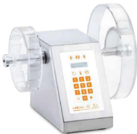
Friability + Abrasion Testers AE-1i with one drum axis AE-2i with two drum axes