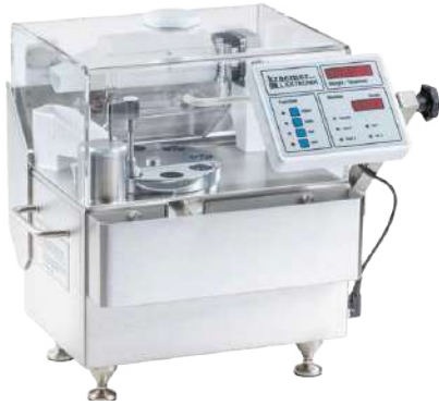
Automatic Weighing System for Tablets & Capsules CIW6.2 / CIW6.3 / CIW6.4