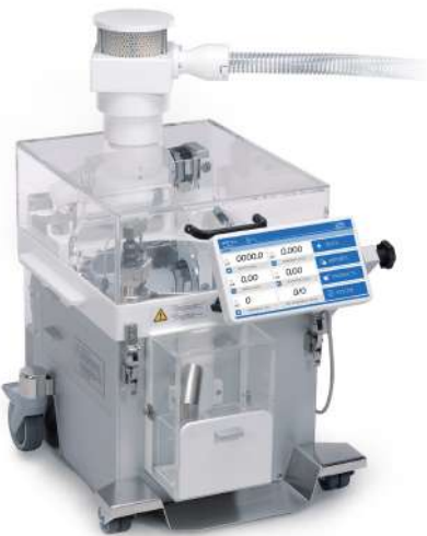
UTS-S20. Dust-proof Tablet Testing System (OEB level 3)