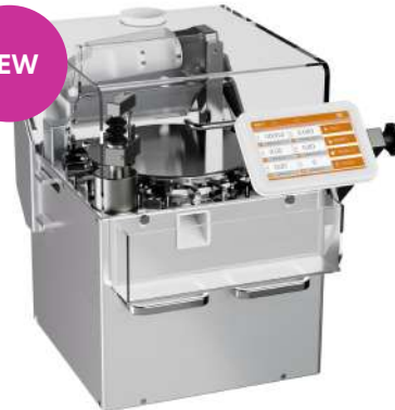
UTS 4.3 Automatic Tablet Testing System with Touch Software (available in Lab & IPC Versions)