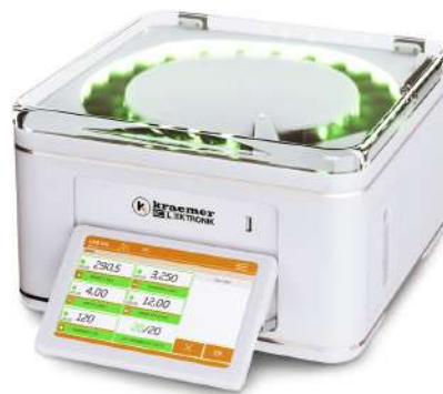
P-Series. Semi-Automatic Tablet Testers P3, P4, P5