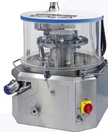
UTS-IP65i. Containment & Wash-in-Place Tablet Testing System (OEB level 5)