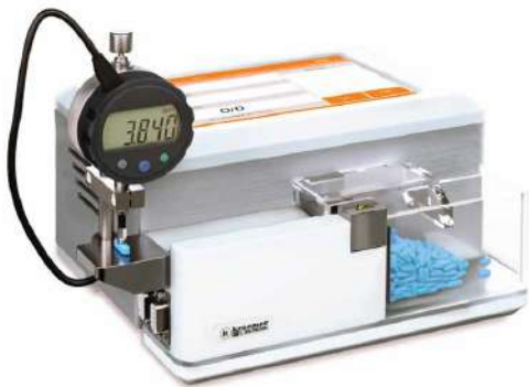
HC7 Tablet Hardness Tester